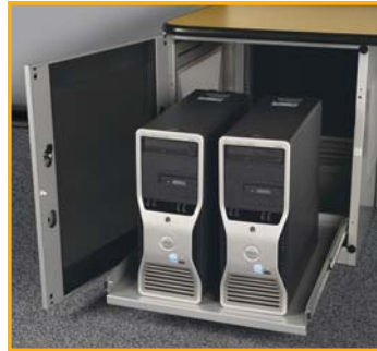
▲ CPU caddies and dockers allow you to efficiently store computers while providing ease of access to connections and outlets.