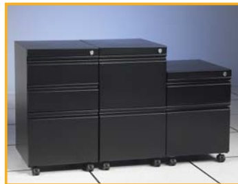
▲ Mobile pedestals offer additional storage below the desktop. Wright Line also offers a wide array of larger cabinets and wood casegoods for additional storage.