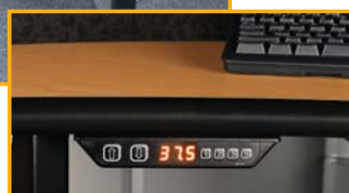
▲ The control pad mounts beneath the keyboard surface to easily manage monitor surface height adjustments.

Improved reading room design increases morale and productivity