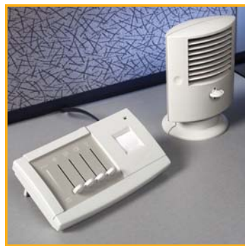
▲ Personal Environments™ offers individual settings at the desktop for temperature, airflow, lighting and acoustic attenuation.