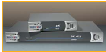
▲ Employing KVM technology allows you to consolidate the number of keyboards, monitors and mice where appropriate.