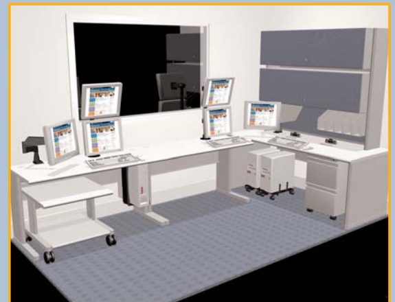
▲ Catheterization Lab Installation – Western United States

Our total service philosophy also includes certified installation teams so your system is assembled with an expert touch. Should you ever need to reconfigure or expand, our installers are available to assist.