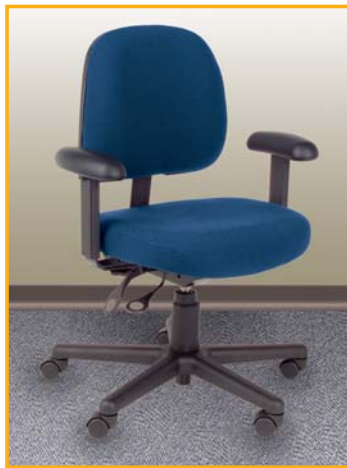
▲ Choose from hundreds of seating options to make your reading room a true ergonomic environment.