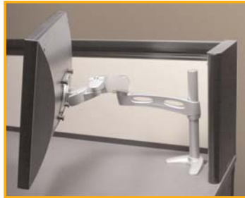
▲ A wide range of FPD mounting options allow you to raise monitors off the desktop and position them for proper viewing.

Wright Line also offers a full range of accessories, seating and storage components to fully outfit your reading rooms as well as other areas of your facility.