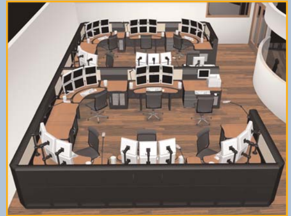
▲ Virtual Intensive Care Unit installation – Southeastern United States

You will get a better feel for your proposed system before it's installed with the 3D renderings our skilled CAD engineers create.