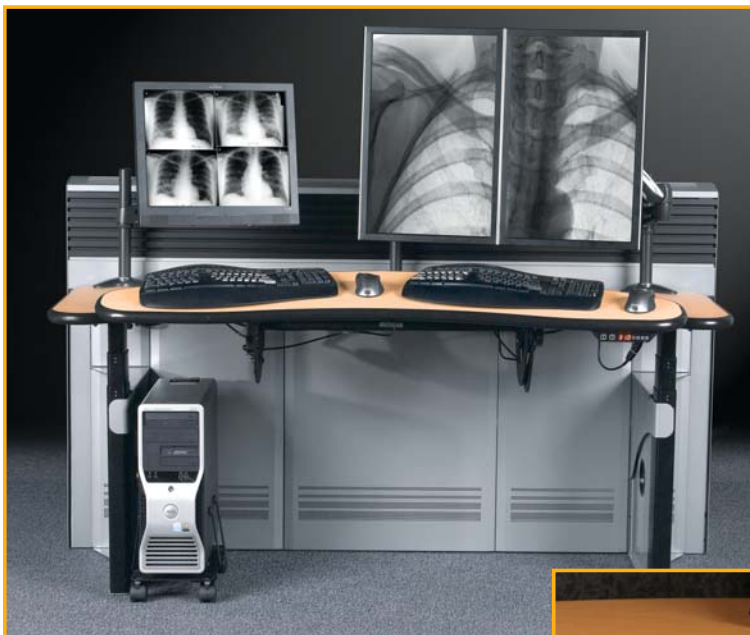
▲ Sit-to-stand lifts for electronic, height-adjustable worksurfaces.